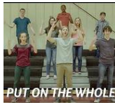
The Armor of God