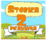
The Parable Song