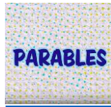
What's a Parable