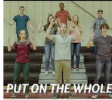
The Armor of God